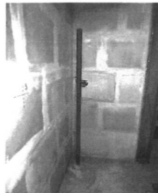
Test Configuration Sample I.D.: ST161011/1