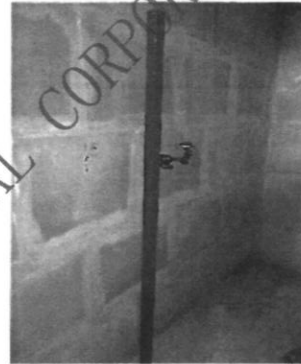
Test Configuration Sample I.D.: ST161011/1