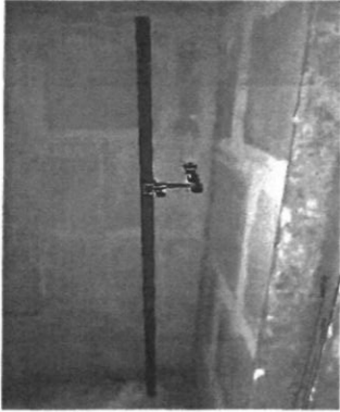
Test Configuration Sample I.D.: ST161011/1