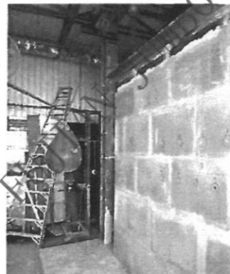
Test Configuration Sample I.D.: ST161011/1