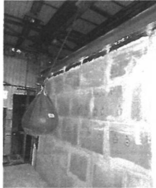
Test Configuration Sample I.D.: ST161011/1