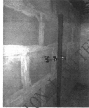
Test Configuration Sample I.D.: ST161011/1